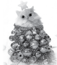
Order a Holiday Boxwood Tree!

Make Holiday Boxwood Trees at Lyn Woodhead's house in Natick; see article in this newsletter for info.