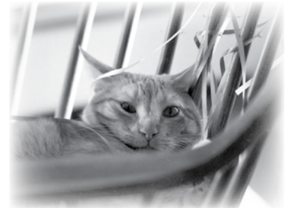
Did I win yet?

Education: It all begins with good litter training.