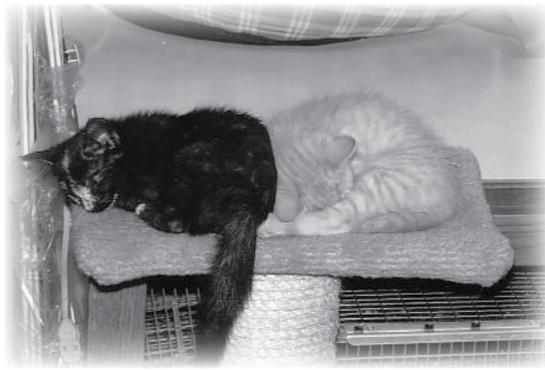
Kittens After Abe's Visit.