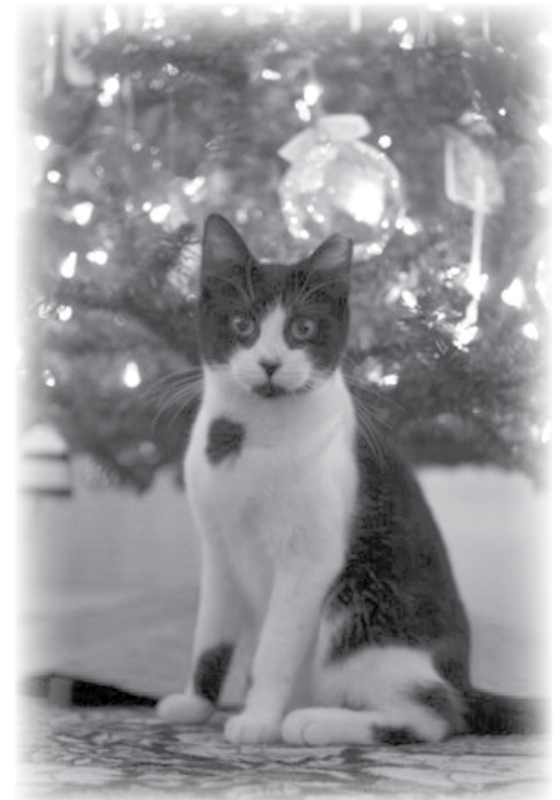
I'm Tux and I'm now in my forever Home for the Holidays!