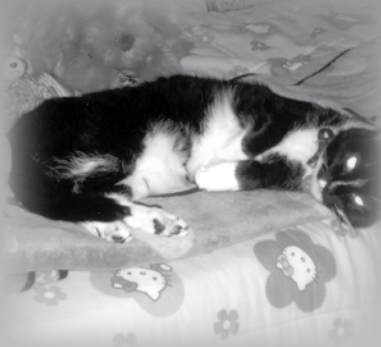
Now I lay me down to sleep...