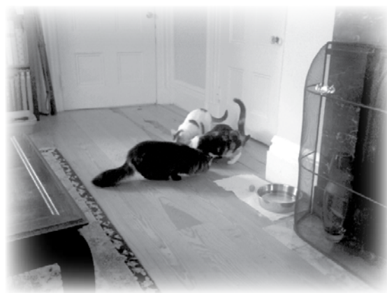
Excuse me, ladies. Bon appetit!